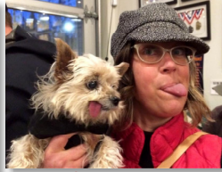
Wookiee & Karen

Girl Scout Troop #43663 (Cherry Crest Elementary in Bellevue) used money from their cookie sales and other fundraising events to support ODH.