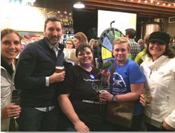
Our friends at Seattle Veterinary Associates

It was an evening of good fun and good beer at Reuben's Brews Thank You Thursday . Reuben's Brews donated $1 for every beer sold that night and Seattle Veterinary Associates matched every $1 raised. Thank You!