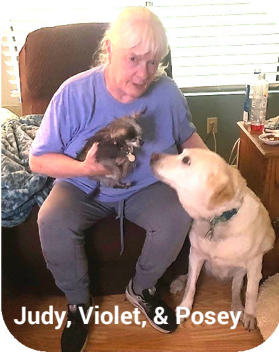
Judy, Violet, & Posey

We've had many dogs in our lives, mostly Great Danes, Chihuahuas and Italian Greyhounds.