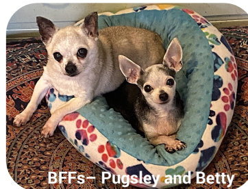
BFFs - Pugsley and Betty

After years of fostering, I was looking for more, and a friend told me about Old Dog Haven. I immediately contacted them and started out transporting—picking up dogs from shelters and delivering them to their new homes. Soon enough I ended up taking on my first final refuge foster, Gidget, who I was lucky to have for six years. She was such a good ambassador for ODH, and I call her my "gateway dog" because she opened the door to so many more. Some have stayed for years; others for only a few months. But they all left a piece of themselves with me and took a piece of me with them.