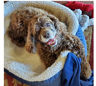
Final Refuge foster Harley