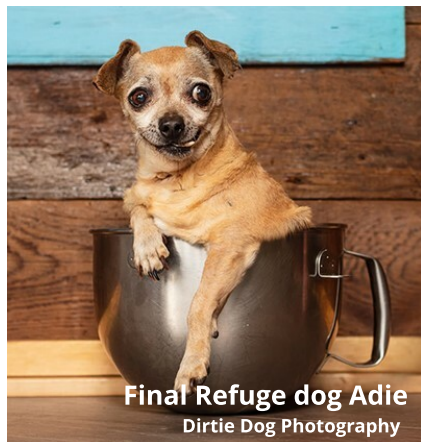
Final Refuge dog Adie Dirtie Dog Photography