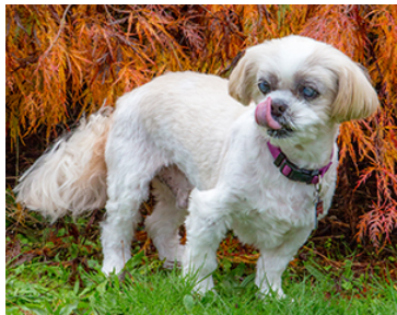
Final Refuge foster Miles