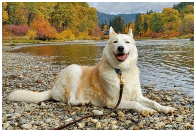
Phyllis is living the life!

Phyllis – perhaps husky/shepherd – was in at least three shelters before her luck turned around. Phyllis now lives with an Old Dog Haven Final Refuge family, where she will remain, safe and loved, for the rest of her life.