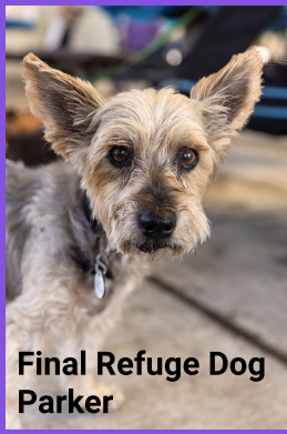
Final Refuge Dog Parker