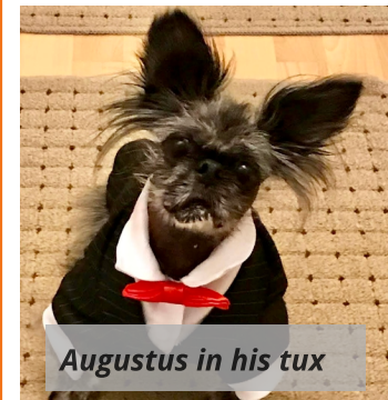
Augustus in his tux

Being old and often experiencing multiple health issues means that time is precious for ODH dogs. But the enormous love and care they receive from their ODH fosters often gives them a new lease on life, and sometimes they surprise everyone by enjoying many happy years before they pass away. Augustus , and on the following page, Yoda , are two such dogs.