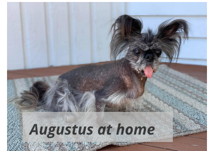
Augustus at home