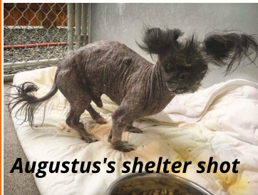
Augustus's shelter shot